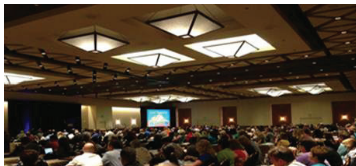
Participants listen intently during one of the well-attended national conference sessions.

Plans are already underway for the 9th Annual FTA Drug and Alcohol Program National Conference to be held in Little Rock, AR, April 2014. Visit our website ( http://transit-safety.fta.dot.gov ) in the fall and look to upcoming newsletters for more information! ●