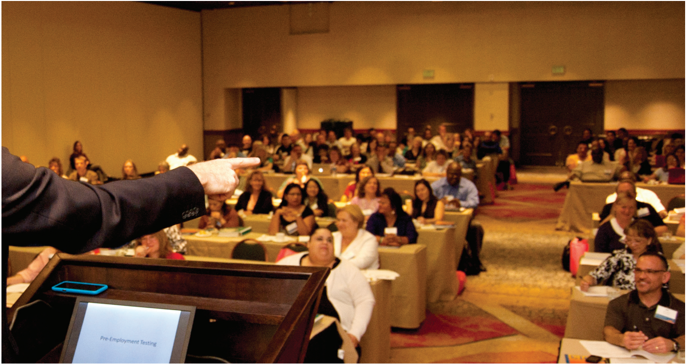
Attendees at the FTA Drug and Alcohol National Conference attend a session on Drug and Alcohol Testing records.

When the U.S. Congress directed the FTA (among other modes) to require drug and alcohol testing in the 1991 Omnibus Transportation Employee Testing Act, one of the line-item directives was to “provide for the confidentiality of test results and medical information (other than information relating to alcohol or a controlled substance) of employees (Section 6(d)(7)).” FTA implemented this mandate in Section 655.71(a), which states: “An employer shall maintain records of its anti-drug and alcohol misuse program as provided in this section. The records shall be maintained in a secure location with controlled access.”